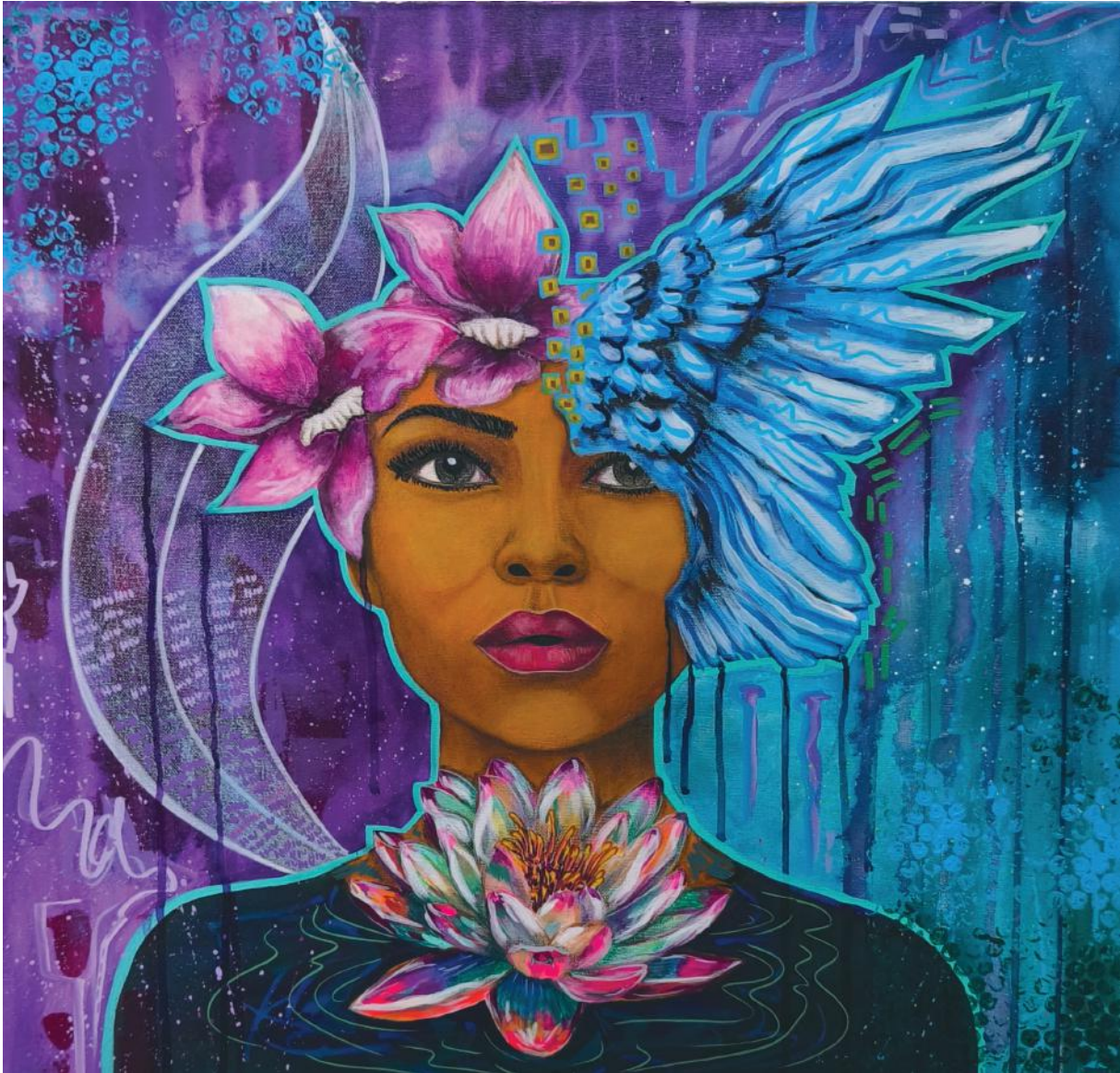
Disclosure Mixed Medium 60cmx60cm 2025