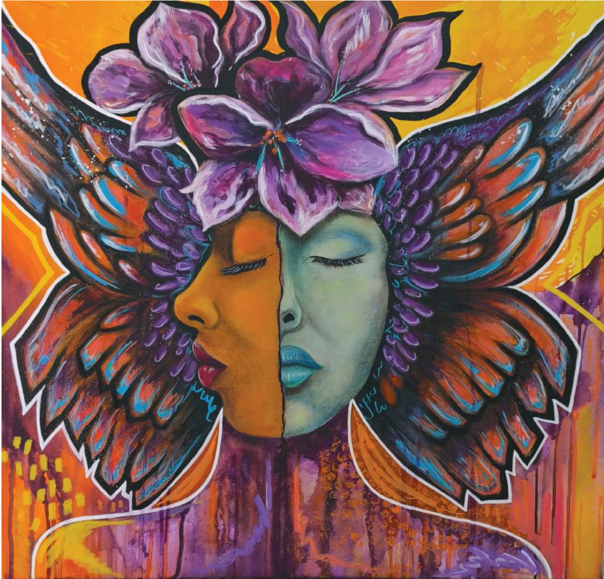
Acceptance Mixed Medium 60cmx60cm 2025