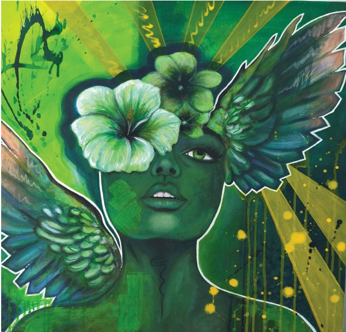
Reclamation Mixed Medium 60cmx60cm 2025