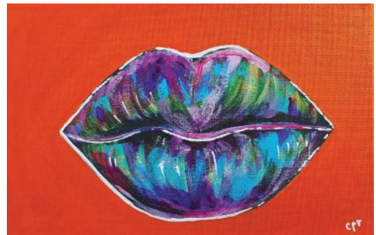
Pop Art Mixed Medium 20cmx30cm 2025